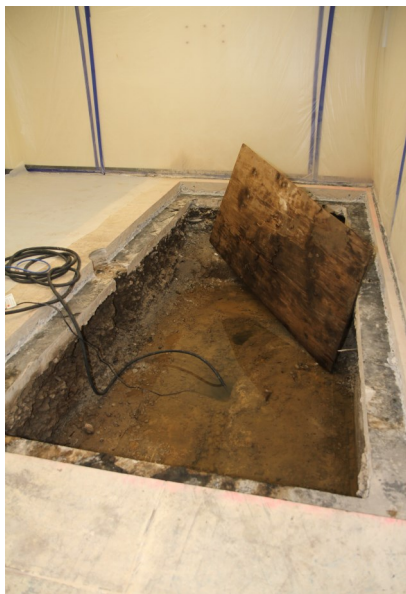
The OSCR design team removed a section of the floor in the Capitol basement to assess soil conditions important to earthquake protection.

In March, several exterior investigations were conducted by the team's historic preservation architects, Architectural Resources Group. ARG used swing stages and boom lifts to work their way around the building, examining the condition of the Capitol's exterior marble, joints and windows.